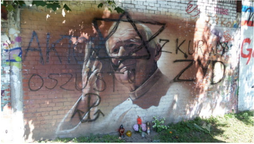
FIGURE 3 Antisemitic graffiti on a mural of Pope John Paul II, in Kraków, summer 2013. It accuses the Pope of being an actor and a fraud, a Jew. (“Z kurwy żyd” is literally “Jew of a bitch” instead of the usual “son of a bitch”) because of his ecumenism and rapprochement with “our older brothers in faith.”).

Jews. 15 The claim here is that Poland is ruled by Jews, a claim made clear in the caption “List of jews in enslaved Poland.” 16 That process of turning opponents into “Jews” is so prevalent that some liberal Catholic Bishops are often accused of being Jewish. Even John Paul II, recently canonized, is not immune to this magical antisemitism (see figure 3).