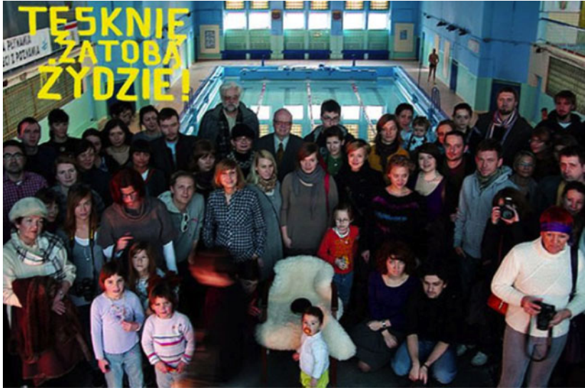
FIGURE 5 “I miss you, Jew” happening in the Poznań New Synagogue, built in 1907 and repurposed as a swimming pool for Wehrmacht soldiers by the Nazis in 1940. Recently it was converted into a gallery space, and plans to establish a Center for Judaism and Dialogue are under discussion. Source: © Rafał Betlejewski, used with permission of the artist.

Combatting antisemitism by purging the word “Jew” of its negative connotations in Polish is just one of this project’s aims; 28 it also works to reclaim the memory of a part of Poland and Polish national identity that is experienced much like a phantom limb pain. 29 That is, the tragic “disappearance” of Jews and Jewish culture from Poland is presented (and increasingly experienced) in many Polish milieu as a tragic loss for Polish culture, and it is in that name that it must be rescued, saved, revived.