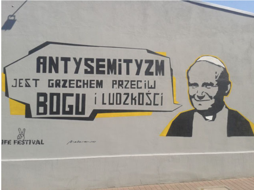
FIGURE 4 On this mural, painted on the occasion of the 2014 Life Festival in Oświęcim (where Auschwitz-Birkenau is located), John Paul II proclaims that “anti-Semitism is a sin against God and humanity.”