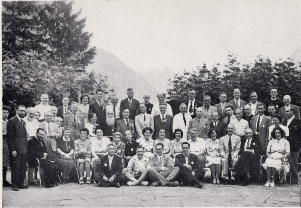
THE FULL CONFERENCE