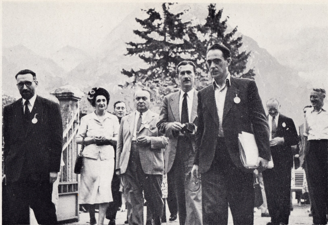
ON THE WAY TO WORK